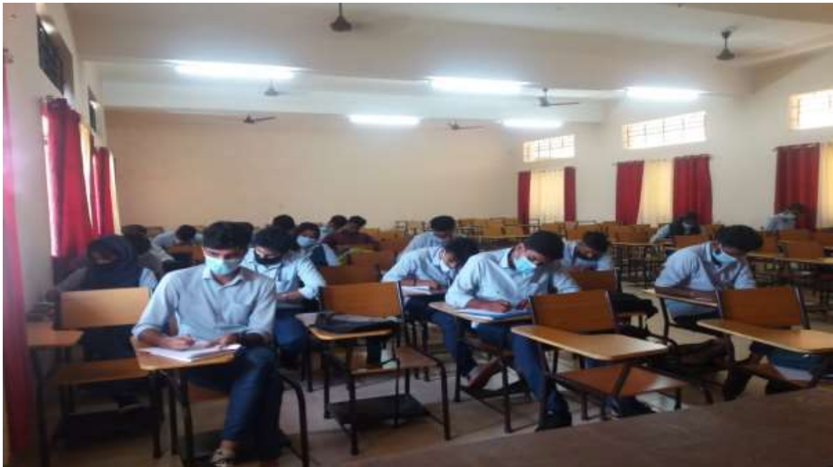
Essay writing session