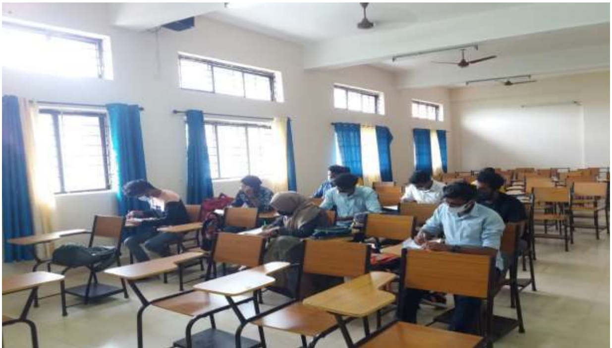
Essay writing correction session