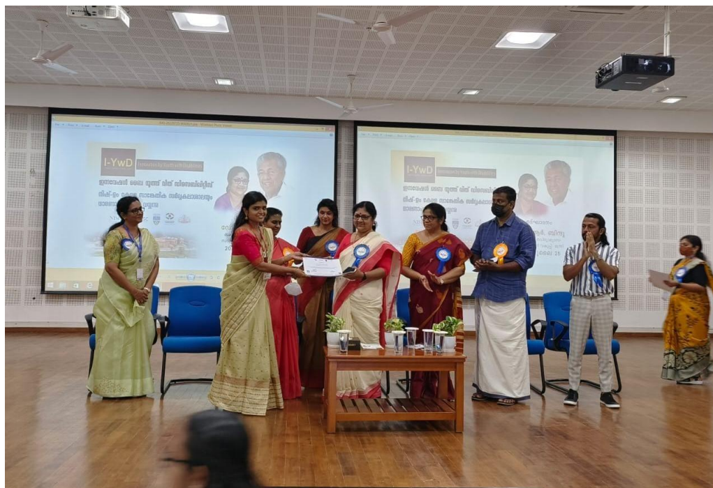
Receiving the certificate from Dr. R. Bindu, Hon. Minister for Higher Education & Social Justice at NISH