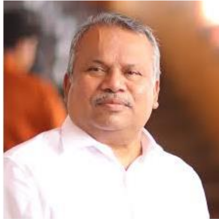
Sri. Mullakkara Ratnakaran - MLA & Former Minister of Agriculture